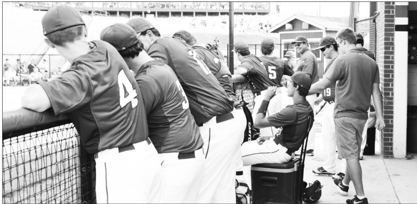
The Indians dugout during the late innings of game one at Bowdon.

where he experienced some issues with footing due to a hole that was continually forced his left foot to slip upon delivery.